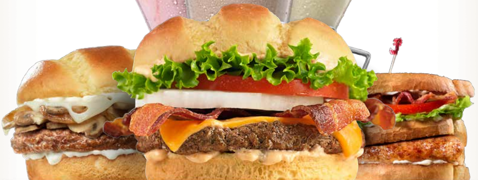
ROUTE 66 HAMBURGER