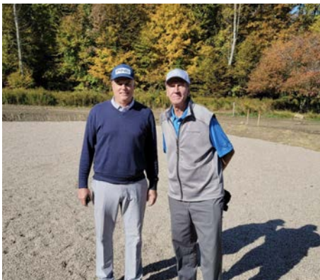
GOLF GROUNDS & MAINTENANCE