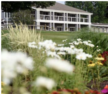
CLUBHOUSE; F&B AND SPECIAL EVENTS