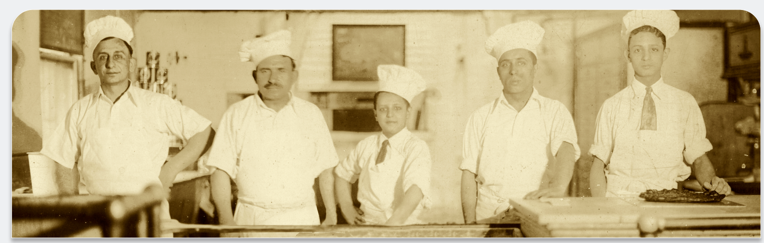
Original Crew, circa 1930's